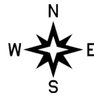
Diagram: Include streets, traffic controls, obstacles, etc.

* Include any conditions that may have affected the collision such as weather, road or light conditions.